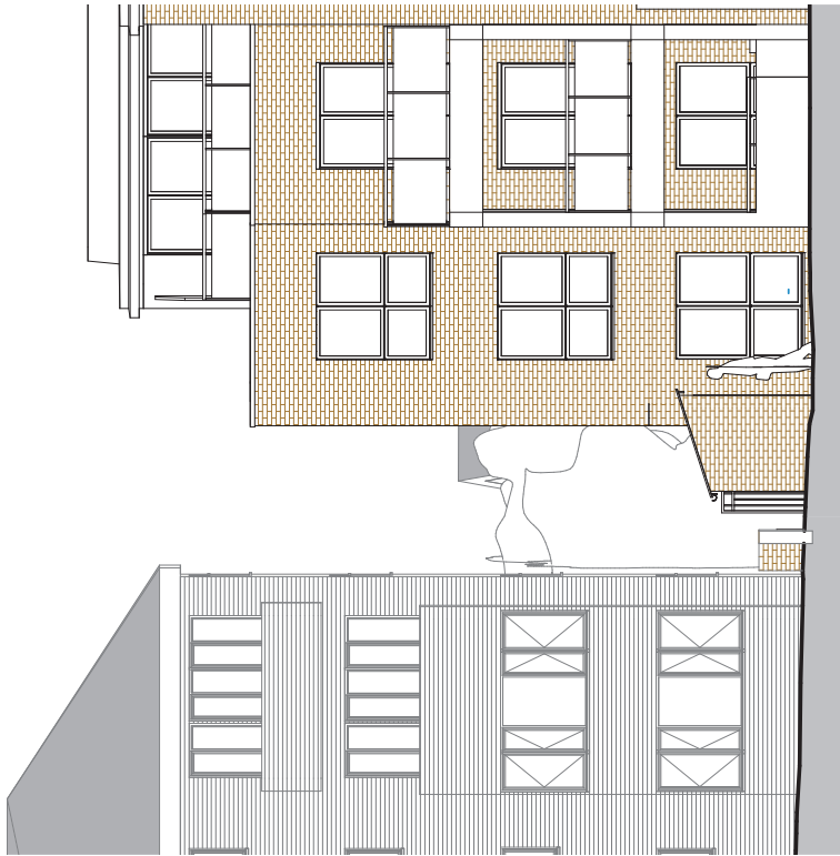
Bin Store Site 1 : 100